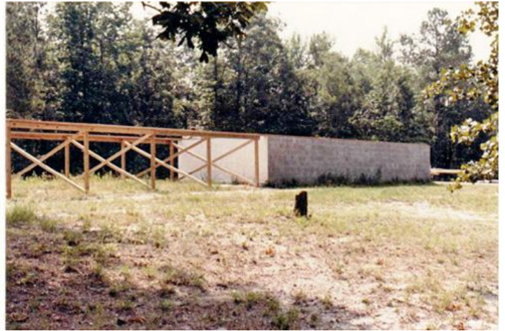
AAS Moore's Meadow Observatory under construction